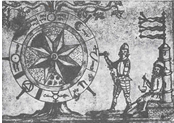
Fig. 3. The Rotation as key alchemical process: Mercurius activating the 8-ray wheel. From Speculum Veritatis , 17 th c. In Jung's Psych & Alch , Fig. 80.

Interestingly, the Rotation (and circumambulation) is also a key process in the alchemical Great Work, the crucial dynamics (guided by Hermes/Mercurius himself) in order to reach the stage of the Stone – the marriage Moon-Sun, or the fusion ego-Self (Fig. 3).