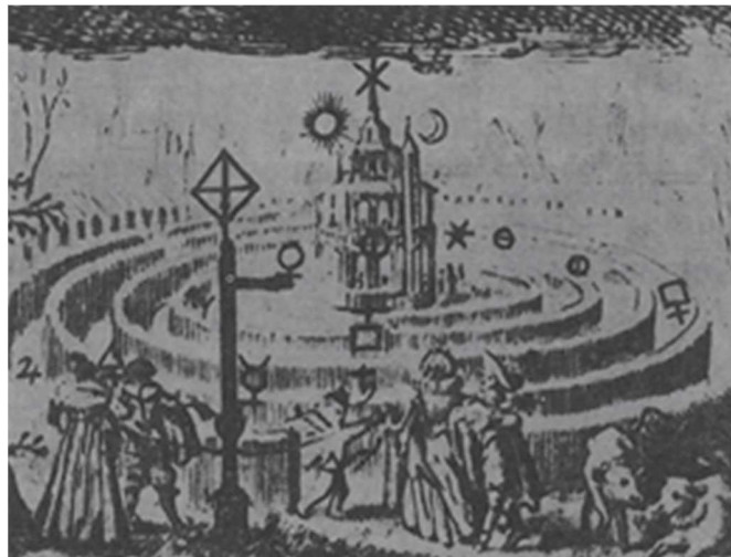
Fig. 2. The sanctuary of the philosophers’ stone ( lapis ) at the center of the planets’ orbits. From Van Vreeswyck, De Groene Leeuw . In Jung’s Psych & Alch , Fig. 51.

Indeed, says Jung, after mentioning that our total personality includes the unconscious “This totality is composed of the ego and the non-ego [the unconscious]. This is why the center of the circle expressing the totality wouldn’t correspond to the ego but rather to the Self, the keystone (epitome) of the total personality ( the center with the circle is also a well-known allegory of the nature of God).” He then mentions the Atman (the personal Self) having a cosmic and metaphysical quality or facet as a “supra-personal atman” (in fact, called purusha or brahman , the cosmic consciousness). (Jung, Psych & Alch , Part 2, III2, Pg 137; Fr. 142). The philosophers’ stone, or Lapis, the symbol of the achievement of the Totality of Man, thus stands at the Center of the Circle (Fig. 2).