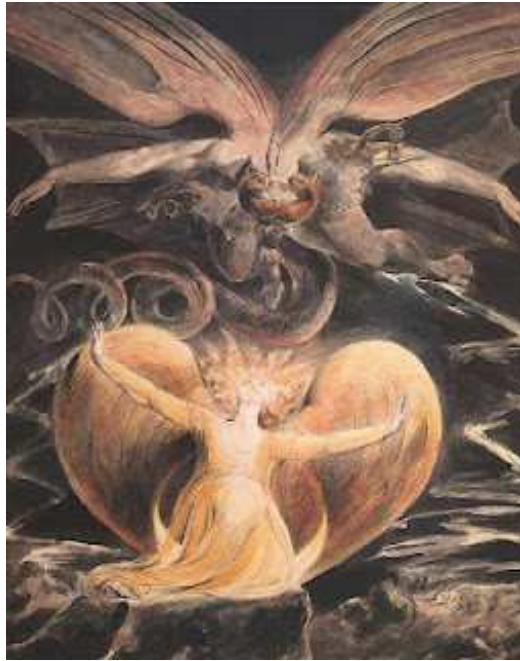
The Great Red Dragon and the Woman Clothed with the Sun William Blake.

profoundly affecting their serotonin metabolism. William Blake is a person who was gifted with a natural tendency to visionary experience, a tendency shared by many prophets, sages and shamans throughout history.