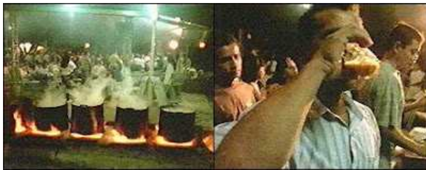
Union Vegetale ceremony

It is then little wonder, although a devastating commentary on the spiritual fragility of Western society that we have sought to ban these genuine agents of enlightenment with severe penalties from long imprisonment even to execution, in a futile attempt to repress them. Penalties comparable to Deuteronomy's dire punishments for adultery, parental disobedience, or worshiping strange gods, rather than a scientifically and religiously tested openness to incorporate them into our traditional religious life. Society is prepared to continue to do this despite the fact that in all experiments where conventional non drug-taking people are given the opportunity to experience these agents, they consistently claim to have had genuine religious spiritual experiences which remain of beneficial significance and meaning to their lives years later.